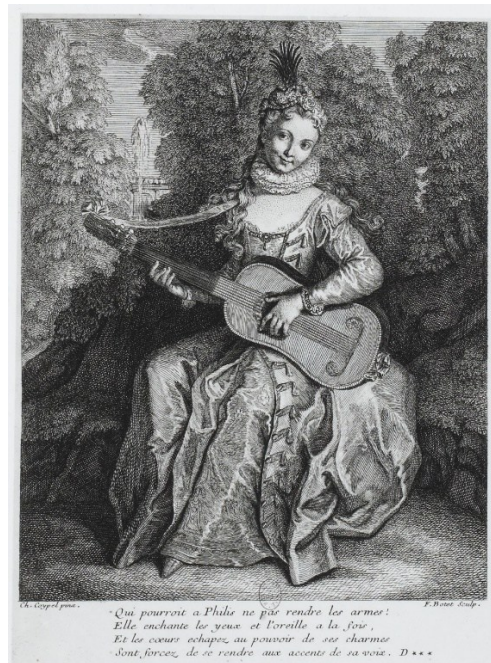
La Guitariste. Engraving by F. Bolet after a painting by the French artist Charles-Antoine Coytel (1694–1752).