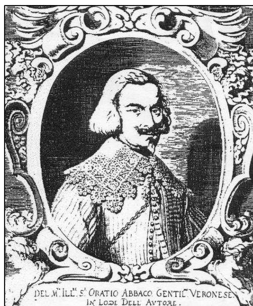
Pl. 44.1. A somewhat fearsome portrayal of Giovanni Paolo Foscari. I quattro libri (Rome c.1630).

In the service of princes, the Italian lutenist and guitarist Giovanni Paolo Foscari (fl. 1629–49) was a member of the Accademia dei Caliginosi . There he was known by his nickname 'Furious' L'Accademico Caliginoso detto il Furioso . 7 His picture appears to bear this temperament out. Concentrating his volatile energies Foscari left a compendium of dances and miscellaneous pieces for Il primo, secondo, e terzo libro della chitarra spagnola assumed to have been released around 1630. A fourth book was added to an edition printed about 1632, I quattro libri della chitarra spagnola , Pl. 44.2. Amounting to five books by 1640, this composite volume contains new and earlier music of his: Li cinque libri della chitarra alla spagnola (Rome, 1640). From this edition books I and II have variations in rasgueado , but subsequent volumes reveal developments. Book III for instance begins with a couple of pieces fully intabulated.