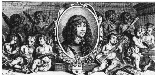
Pl. 53.1. Francesco Corbetta and a band of cherubs at play. They all look very wise.

Suiting the tastes and abilities of society at large, they also chimed with connoisseurs who wished to participate in singing rather than just witness it. Moreover, the widespread enthusiasm for these song collections testified to the popularity of the guitar in 17th century Italy.